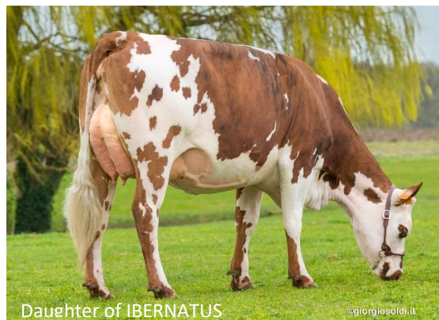
Daughter of IBERNATUS