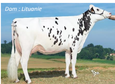
Dam : Lituanie

NIKERBY (ADAGIO P x RUBICON) is a new one coming. He provides an excellent mix of components and fertility (+2.0). His daughters would have more than 60% of NRR (at 90d). NIKERBY will build strong and healthy cows. He comes from DAMION CAPRIKA EX91 family which produce bulls like LIVEBOX or ILIADE.