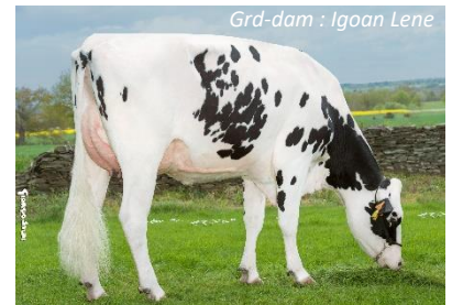
Grd-dam : Igoan Lene

NUBILENE combines all the needed assets for grazing systems. He will build strong (+1.8) and medium sized cows with excellent feet and legs (+2.0) which will last in the herd (+2.4). His daughters have more than 90% chance to start a 2 nd lactation. He provides good fertility (+1.3) and healthy milk (+2.1) to his daughters. NUBILENE comes from the same family as bulls like ISMORE and DIDOT.