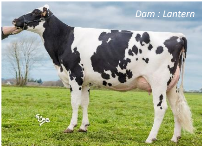
Dam : Lantern

EVOLUTION BULLS = 31% OF INTERNATIONAL AND 53% OF FRENCH ISU RANKING