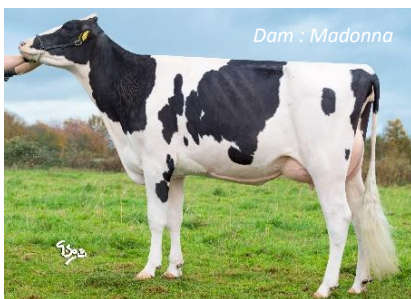
Dam : Madonna