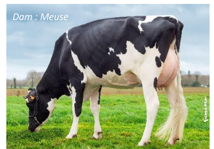
Dam : Meuse

OUED perfectly combines milk and components. He is very functional and holds all the needed assets for grazing systems. He provides perfect feet and legs with an excellent resistance to non-infectious lesions (+1.4) so that his daughters have 30% less risk of triggering lameness. He also provides good fertility (+2.2) and healthy udders (+2.5) to his daughters. OUED comes from the highest herd 2019 in ISU and a leading family that marked genomic selection. Indeed, his great grand dam is LOUXOR's dam. He is available in conventional semen.