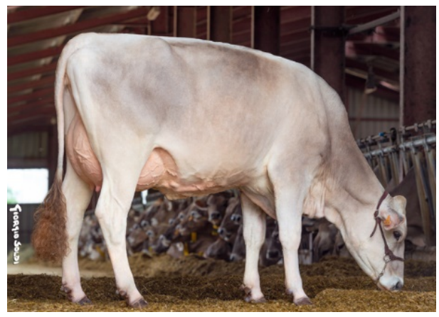
OHEA ABF, SKYFALL'S DAM

He ranks at the top of several genomic lists, with 1486 GZW CH he is in the top 5 in Switzerland and number 7 of foreign bulls in Germany at GZW 133. He comes from the family of Zeus CH ZEA EX 94, dam of Fun ABF, she produced 117,943 kg in her career at 4.68 %F and 3.62 %P! SKYFALL is a complete bull on all traits and which presents an interesting milk potential, along with improving fertility and longevity. He will also sire excellent top lines and good feet and legs. The udders will be high and very well attached, the teats with a short tendency will have to be taken into account in the mating. An interesting asset is the good muscularity combined with high production. He offers the sought-after BB and A2A2 caseins, available sexed semen.