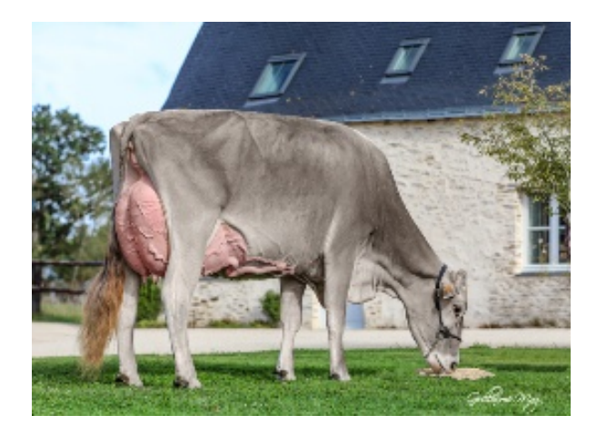
LBB LALICE, LBB RALICE'S DAM

He remains the best son of O Malley for milk at+1688! Associated with a flawless linear morphology, it will bring dimensions in the body and rump, with very good feet and legs. The udders will be very good with a strong ligament and a high rear attachment. He is also a daughter fertility improver and BB A2A2 enhancer. LBB RALICE ranks well in Italy at 961 ITE with +1147 milk and 118 type and udder. He is available conventional and sexed.