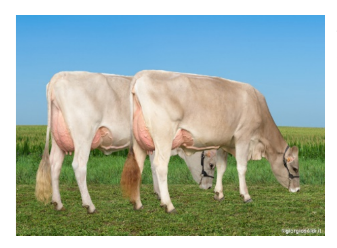
O MALLEY Bender x Glarus x Dally aAa 423561

He doesn't have yet a big number of daughters in the proof for the December run, but we expect more than 150 in April 2023. Many O MALLEY cows are calving in France and Switzerland, and other countries. The most exported bull from France in the last years has a strong influence also through his numerous sons worldwide. First feedback from the field are very encouraging: they give a lot of satisfaction to their owners, with very good production, nice udders and balanced cows. We look forward to next year development of O MALLEY as a proven bull, still available both conventional and sexed. BB and A2A2.