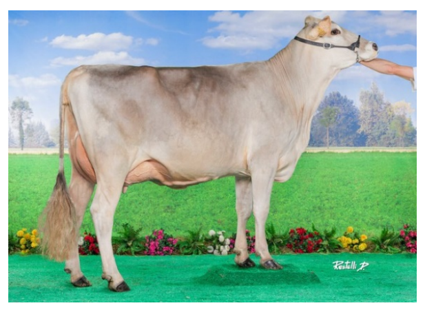
PARRURE, NICE GP'S DAUGHTER

NICE GP keeps adding daughters to his proof and improving again his total ISU of +11 pts! With close to 200 daughters in production, he has a unique profile with +2.5 udder, +2.0 udder health, +1.8 fertility and +1.7 longevity ! NICE GP makes the powerful kind of cows people love to work with, health and long lasting! He gained also in Switzerland with now 1345 GZW, in the top 5 of his generation