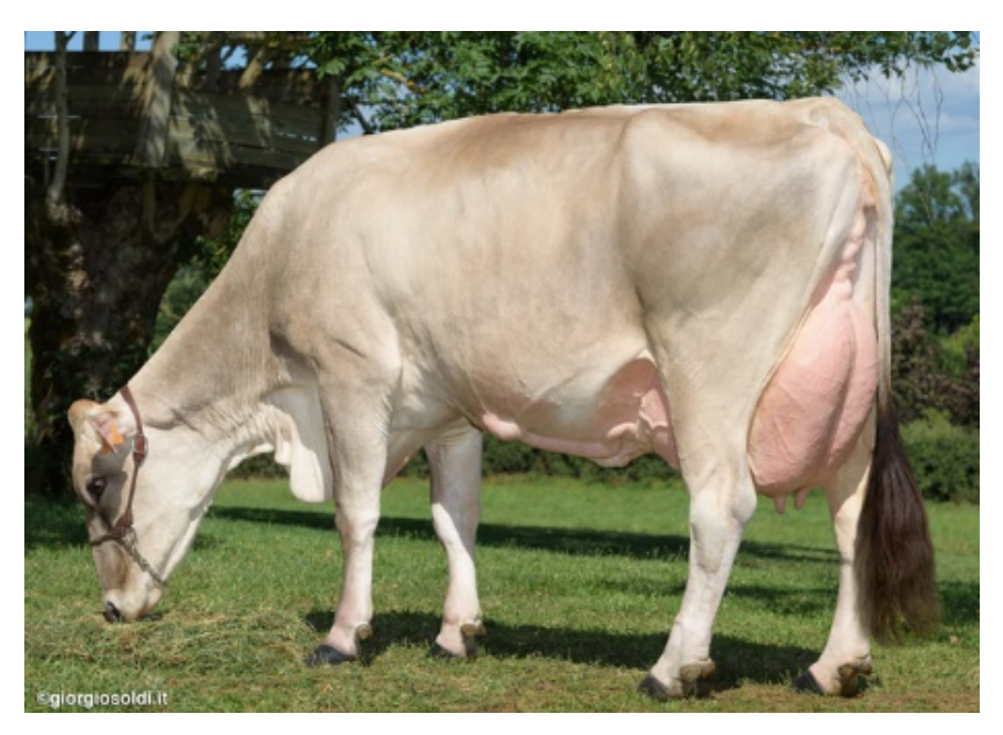
MADMOISELLE, SATURNE'S DAM

Born at Gaec Brast in Aveyron, SATURNE will appeal to dairymen looking for a high level of production without sacrificing components and fitness traits. IFEELING Madmoiselle, his dam, has just completed her 4<sup>th</sup> lactation in 305 days at 10,318 kg with 4.75 %F and 3.89 %P. In her pedigree we find Vigor IGELLE VG 86 and Jolt CHANTELLE VG 87, going directly back to the famous Hussli TIGELLE EX 90 and its 130,000 kg lifetime production! SATURNE is the worthy heir of this extremely reliable family which has already delivered the proven bull ISOLD and more recently NO DECIBEL, which daughters are entering into production with stunning udders. He is one of the rare bulls to combine a high milk potential with very positive components while improving longevity and fertility. The udders will be high and well attached, with perfect teats in size and position. His daughters will be of a more moderate size and he will also bring good feet and legs. He ranks very well in Switzerland at 1437 GZW CH and in Germany at 126 GZW. He has the sought-after BB and A2A2 caseins, available only sexed from January.